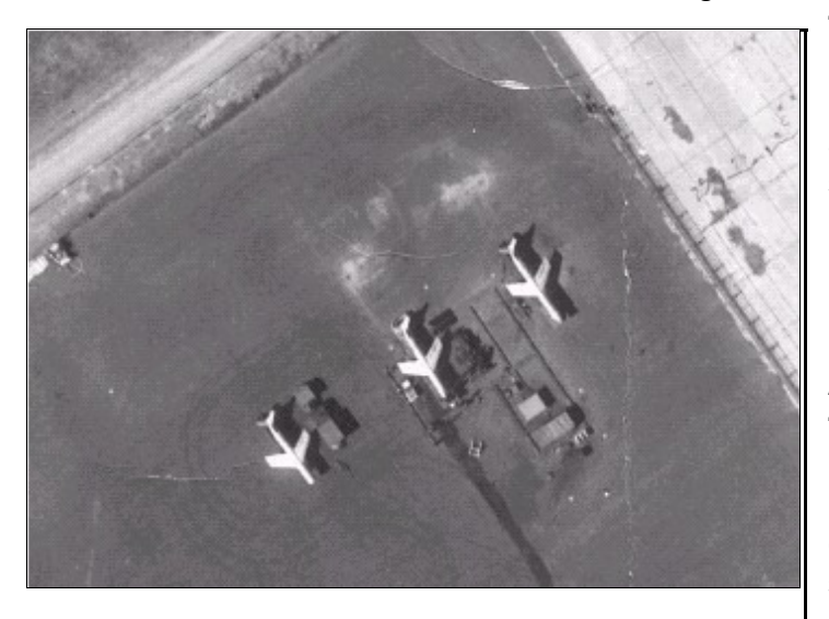
This 1960's era overhead photo of Lowry Air Force Base is similar to the one reviewed by the Army Corps of Engineers during research for the Operational History. Note the discoloration behind the aircraft which was caused by the missile's jet engine.

Background This fact sheet provides environmental regulators, Lowry residents, and other interested community members with information on the past use of perchlorate on Lowry Air Force base. This information comes from the Lowry Operational History and from subsequent Air Force research. The information is provided so that all concerned can make informed decisions as to the potential for the presence of perchlorate in groundwater under the former base. Perchlorate, which has yet to become nationally regulated, is a substance used as solid rocket fuel, but also is used in airbags, fireworks, electroplating and leather tanning. Studies indicate