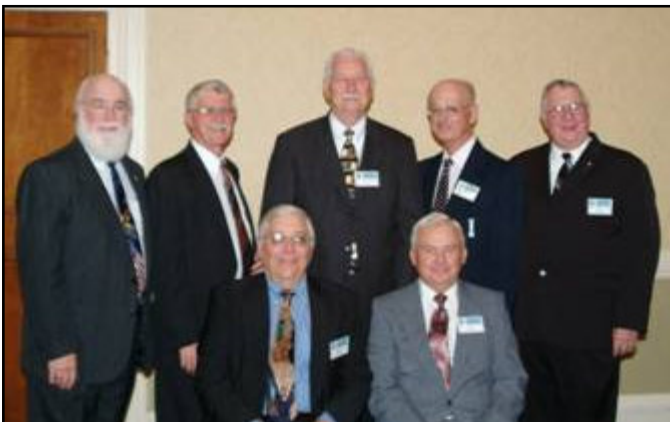
2005 - 2007 TAC MISSILEERS OFFICERS