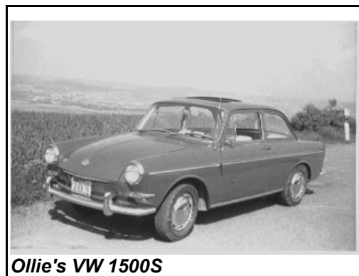
Ollie's VW 1500S