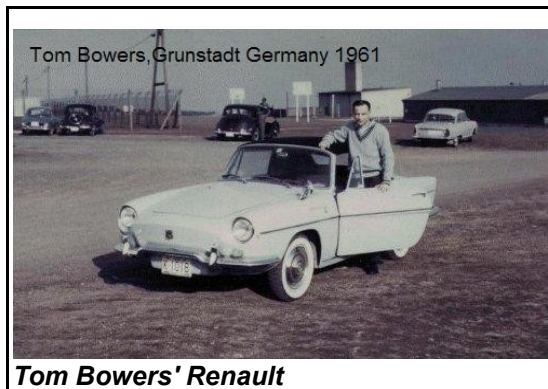
Tom Bowers, Grünstadt Germany 1961