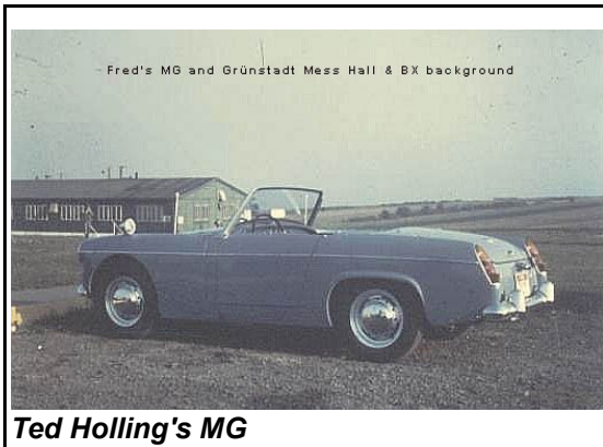
- Fred's MG and Grünstadt Mess Hall & BX background