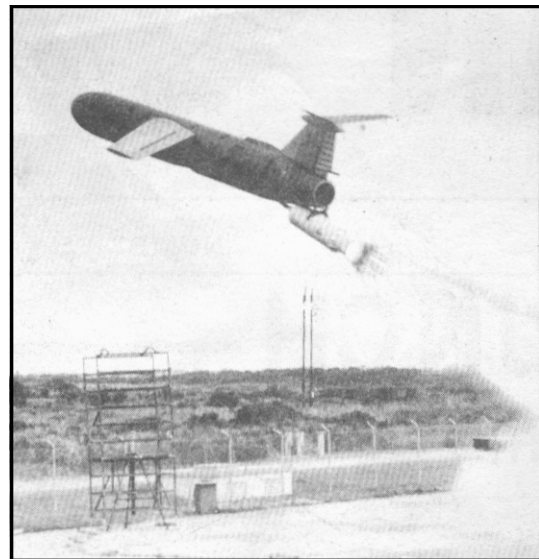
Third Mace B launched from the Cape — 11 Feb, 1960. Using a translauncher, just before the Cape's Mace B hard sites 21 & 22 were ready for use.