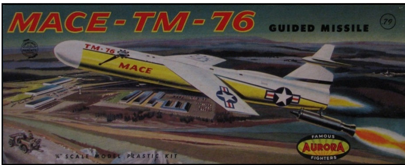
The Aurora, plastic model Mace 1/4 scale kit, sold originally for 79 cents . An original still in the box, just sold on eBay for the grand sum of $219.00 .