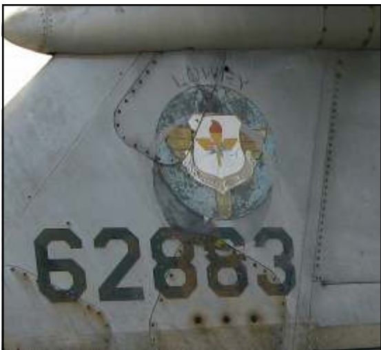
Notice the disparity between the serial number on the fin, left, and the serial number on the missile ID placard at right. Wondering if the fin is the original with the fuselage just mismarked at some time past or a complete replacement from another bird?