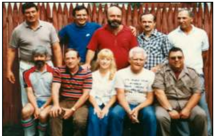
887th TMS Reunion 1985 at Bolivar, NY