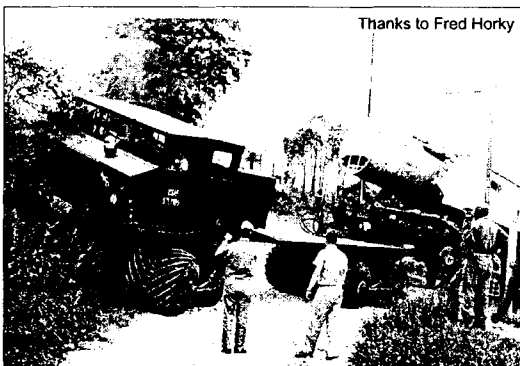
"Sorry Captain, I always take this shortcut with my VW, and I've never had a problem!"