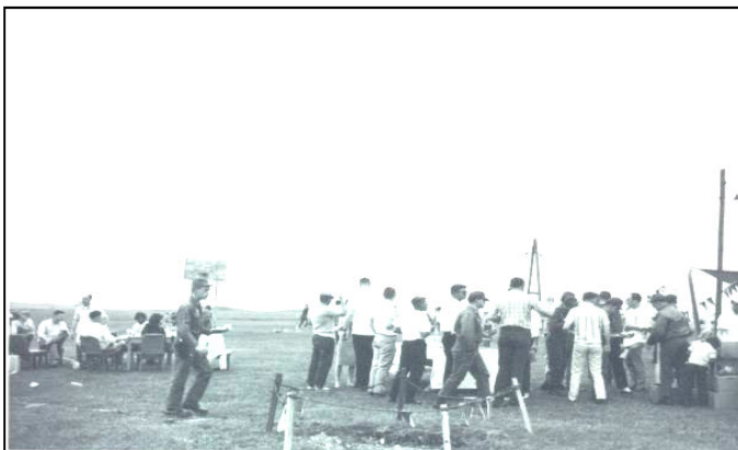
It's Party Time

Postmaster Please Forward If Undeliverable, Return to Sender