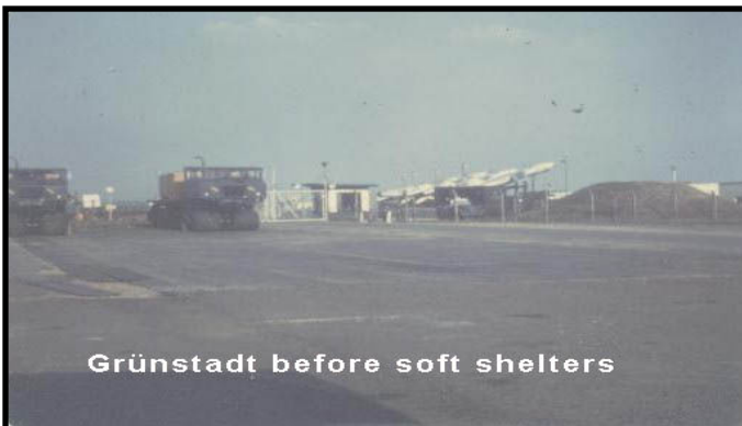
Ted Hollins collection

"Just as pilots wear the same badge whether they fly fighters, bombers, tankers or transports, all very distinct and different missions, our space professionals should wear the same badge to reflect the