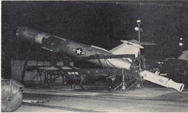
MISSILE fell when shear bolt broke during lowering operation.