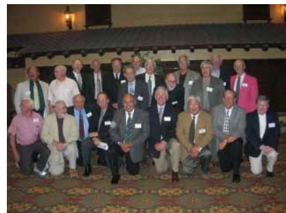
Hahn AB Missileers