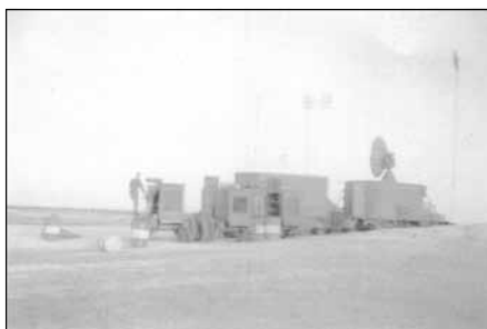
Northern Germany MSQ1A System Libyan Desert (SE of Tripoli) 1. MPS-19 Radar 2. OA-626 Analog Computer 3. Ground to Air Communications and Spare Parts