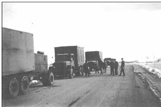
Landsberg am Lech southern Germany. This was the first system to be put into service in Germany.