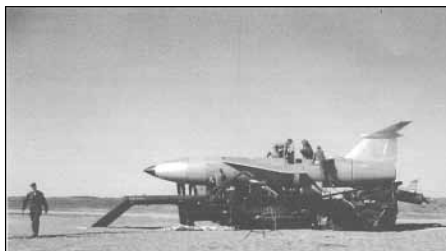
MATADOR Libyan Desert (SE of Tripoli) Preparation for launch — Check out