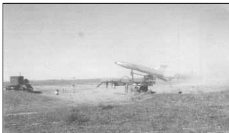
MATADOR Power Up