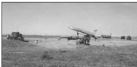
MATADOR Preparation for launch Positioning Ramp