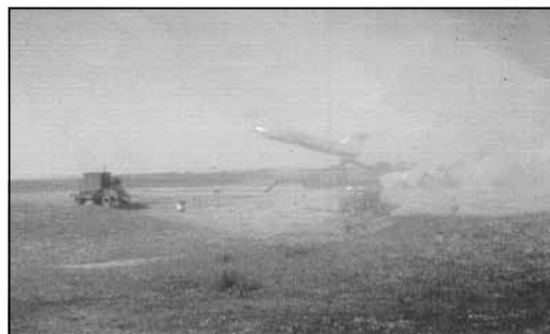
MATADOR Lots Of Noise, Dust and smoke Missile Away!