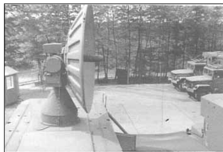
MPS-19 Radar Part of MSQ1A System